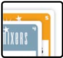
Fig. 2: Max point value