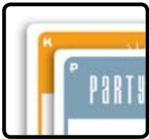
Fig. 1: Keep; Pass